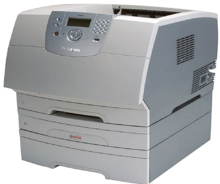
Lexmark T644 rn—RFID Printer Encoder

This new media can also be used to track a variety of documents simply by using the RFID enabled media as a cover sheet. We have yet to explore the variety of applications of this new media, but things that come to mind immediately are certificates, sports timing, tickets, and redeemable coupons. Indeed, anything for which proof of authenticity is required.